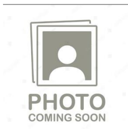
To be Announced